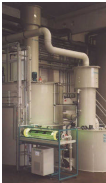
Picture 2: Enviolet® UV-Oxidation system for treatment of EN (electroless nickel) wastewater as described in table 1. Treatment is performed in 12 m 3 batches with a process sequence that all complexing agents are eliminated. The picture does not show the chemical metering unit and control system. The system is expandable to a threefold daily capacity without additional floor space by the stacking of up to three UV reactors.