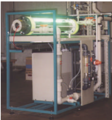
Picture 1: Enviolet® - 12 UV -Reactor with integrated process technique for performance optimization. Besides the necessary monitoring and safety features there are also reagent metering with in-line mixing integrated. The power supply is next to the UV-reactor and is continuously regulated for optimal performance.

Another advantage of this process is that some other spent electrolytes may be mixed together for simultaneous treatment, which is an additional justification for the system purchase since that would shorten the ROI (return of investment) tremendously [2, 3]. But when treating such concentrated chemicals, UV-reactor performance requirements are very critical. However, the UV-reactors, type Enviolet®, see picture 1, were specifically designed for such applications and fulfilling exactly these requirements: